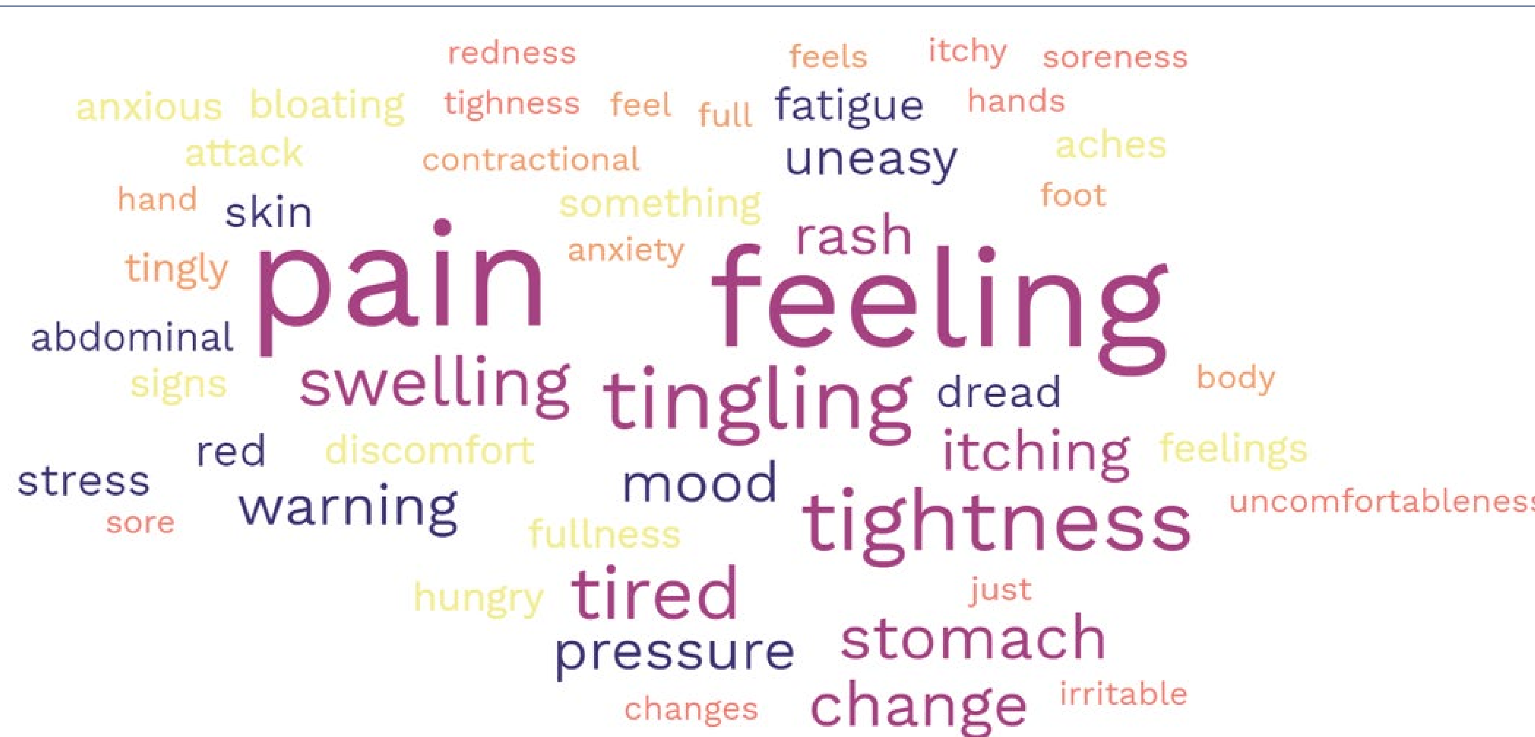
Figure 2. Words Used by Respondents to Describe When an HAE Attack has Started