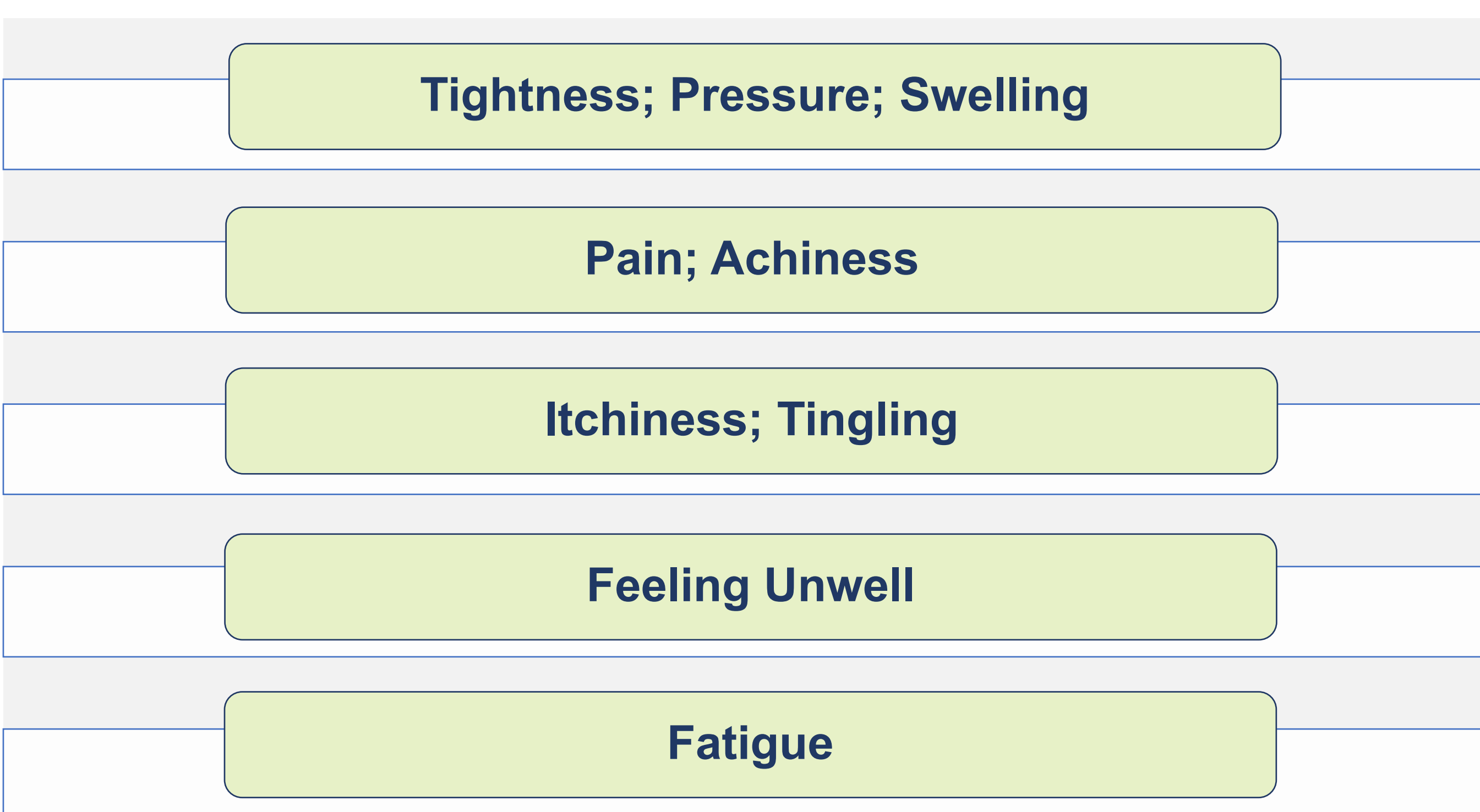
Figure 3. Common Themes of Words Used to Describe HAE Attack Onset